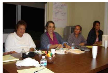
Members of the Ke Ala Laua'e Women's Group