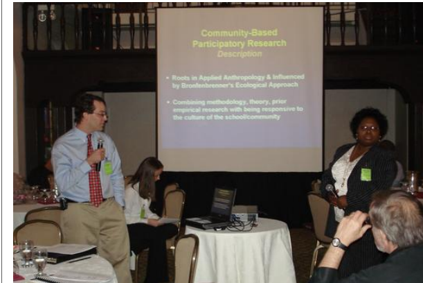
Representatives from The Philadelphia Collaborative Violence Prevention Center