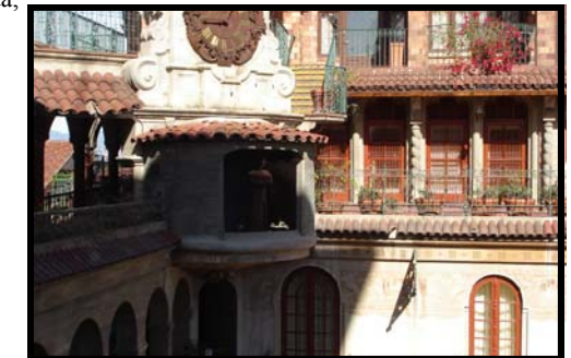
The Historic Mission Inn Hotel

The next ACE Annual Meeting is targeted for October 2008 back in Atlanta, Georgia.