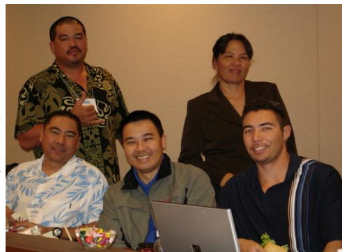
The Hawai'i Team during a working session

Beginning in Spring 2007, we will hold family movie nights on the KHS football field every semester. We will seek a small amount of funding to provide a small meal for families. Each community attendee will be asked to fill out a very brief adult or youth volunteer survey that will assess information on community needs and desires. Prior to